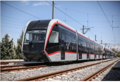
Bozankaya tram with DC charging

Bozankaya's electric buses are distinguished by their long range due to the company's proprietary battery and battery management system (BMS), a result of Bozankaya's extensive R&D investments. Bozankaya has developed catenary-free vehicles by integrating the battery packs and BMS technology in its trams and trolleybuses. Modern intra-city mass transportation typically requires supporting infrastructure like catenary, masts, transformer substations and others. This may be particularly challenging in areas with historical buildings, streets or other infrastructural limitations. Bozankaya's proprietary, high-performance battery packs, BMS and catenary charging modules allow trams and trolleybuses to pass through such areas without any additional construction work for catenary, allowing the integration of these areas into a modern mass transportation network.