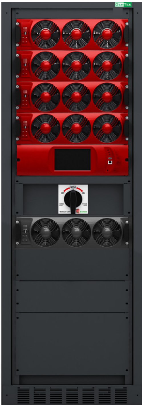
AGIL 80 kVA SBP