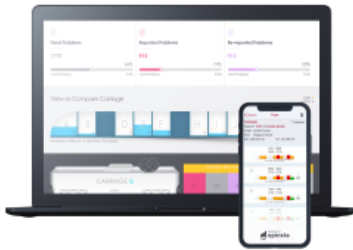
Defect reporting app and dashboard

Opinsta builds enterprise apps, empowering staff to improve operational performance. Opinsta's Defect Reporting solution is being used by Virgin Trains, Cross Country and Bombardier UK and allows staff to resolve or report any defects on trains and stations. Integrated with SAP/Maximo, this app eliminates manual entry, saving time and money for the business. Stats: 100% increase in number of defects reported regarding trains, 74% of all staff actively use the app, 100% of users find the app "very easy" or "easy" to use.