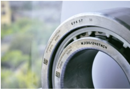
Data Matrix marking of railroad axle box bearings