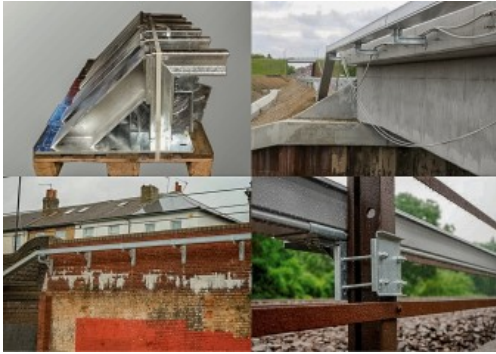
ARCOSystem installations incl. mounting parts