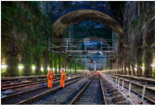
Liverpool Lime Street – wall mounted cable duct system installation

In recent years, the ARCOSystem elevated GRP cable duct has been installed not only along tracks on sigma posts, but also on walls, bridges or on the ground. Installations have been erected in urban areas with dense traffic in which a classical elevation with an attachment to the post is no longer possible. The mounting parts have been continuously expanded and adapted for these installations. Installations have been successfully implemented at the new Liverpool Lime Street train station (wall mounted), Crossrail Anglia from Stratford to Liverpool Street (wall mounted), London Bridge (wall mounted), St. Goarshausen - Boppard (wall mounted on the Rhine route), Erasmus Bridge The Hague (floor mounted), Husum and Lübeck (wall mounted EINLWL size 0).