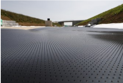
Carbofol® with structure-embossed surface on the new railway track Wendlingen-Ulm PFA2.3