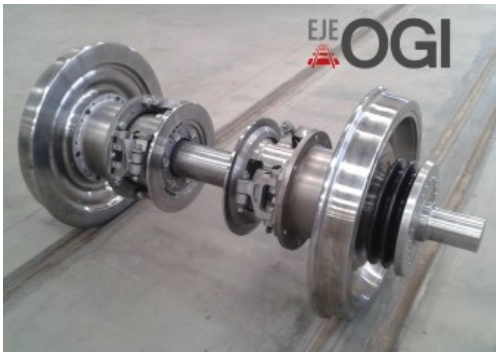
OGI AXLE: Prototype