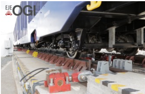
OGI AXLE: Gauge changeover facility

In order to solve the problem of breaks of gauge between the different railway networks in rail freight, the consortium composed by Azvi, Tria and OGI, as well as Adif, has developed an automatic variable gauge system made up of variable gauge axles and a gauge changeover facility. The variable gauge axle approval process set forth by the Spanish ETH standard is verified and certificated by Bureau Veritas, the entity responsible for publishing the evaluation report. Currently, the OGI axles have successfully completed laboratory tests and on-track tests as well as 100,000 km in phases I and II of the in-service tests set out in the standard, and they will obtain provisional technical approval for commercial operation.