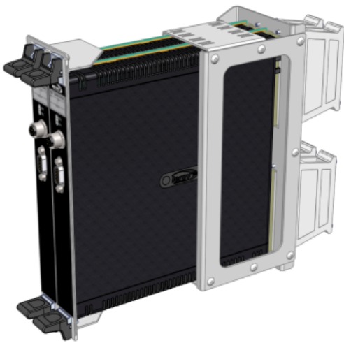
Dual ethernet system for TCMS and traction control subsystems