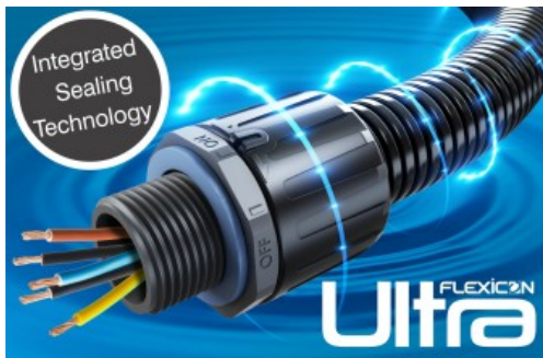
Flexicon ULTRA™: World's best conduit fitting

System integrity is essential for the safe functionality and continuous operation of rail and transport systems. Ingress protection and dynamic performance as well as vibration, constant movement & sudden inertia can compromise system performance. Flexicon Ultra™, the latest product innovation is a one-piece non-metallic fitting solution which offers fit and forget assurance when it comes to performance and integrity. With integrated sealing technology, providing superior IP levels of IP68 (2Bar) & IP69, these fittings offer up to 70 kg tensile strength and provide anti vibration and shock protection. Simplicity & reliability is achieved with a push fit connection and the unique design offers a removal facility using a screwdriver. Flexicon Ultra™ will be put to the test at InnoTrans 2018 on three live demo rigs to illustrate its strength, integrity & assurance.