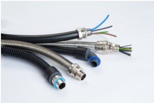
Flexible cable protection for rail