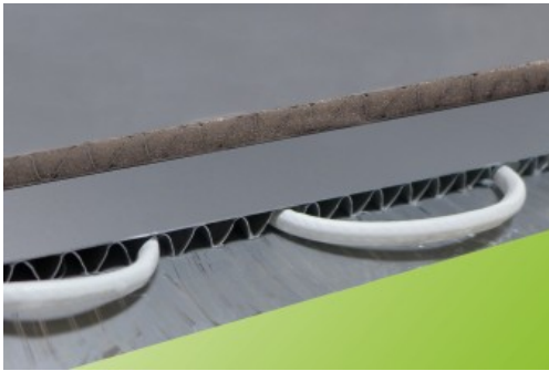
Metawell® floorsystem with sound attenuation and heating