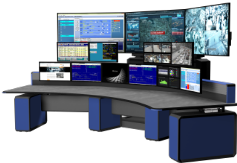
The best console option: Response NEXTGen