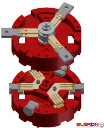
Mixed type moving contacts (earthing/line) assembled in one CDR system for more compact installation

The CDR series can be used in a wide range of applications: as changeover switches, earthing switches, disconnectors, security system isolators. In rolling stock, CDR series components are used to perform series/parallel switching between the winding of drive motors, brake resistors and earthing switches. They are constituted by a body of compact modular structure and enable various solutions with optimal functioning even for high short-circuit currents. They can be enclosed in a metal case and mounted externally on the roof or under the coach floor: they work reliably in any installation position. They can be of four different types: manual or motorized, or with direct or independent torque movement. Upon request the system can be supplied with interlocking keys. ELERON has filed a patent application for CDR.