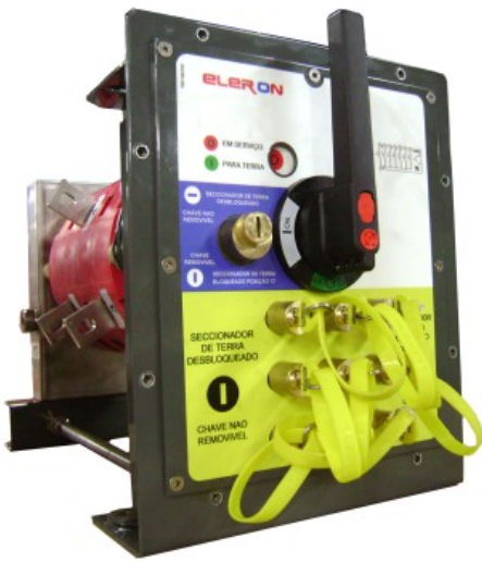
Earthing switches with safety interlocks