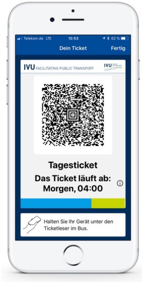
VDV-KA-compliant barcode ticket

IVU is to display the new ticket.app for mobile ticketing at InnoTrans 2018, which is developed in cooperation with the London-based technology start-up UrbanThings. The streamlined software comes complete with a connection search tool and generates VDV-KA-compliant barcode tickets for bus and rail travel. Users can easily log in via their existing Facebook or Google accounts and store their payment method directly in the app for fast ticket purchasing. The app will communicate with Bluetooth beacons to track journeys and manage fare collection. This way, the system facilitates an easy and low-cost 'Be-in/Be-Out' solution, which means that passengers can board vehicles while keeping their phones in their pockets. When used with the settlement software IVU.fare, extensive evaluation functions are available to transport operators.