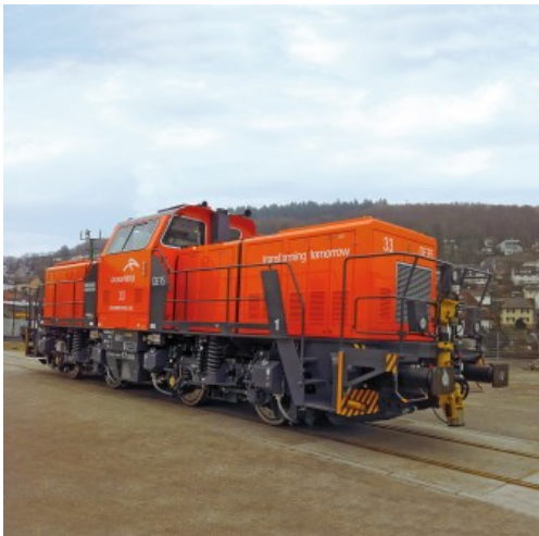
Shunting locomotive DE75 Bo'Bo' Hybrid

For the first time, GMEINDER LOKOMOTIVEN will be exhibiting with the model DE75 Bo'Bo' a 4-axle shunting locomotive with diesel-electric drive for the heavy shunting service. The electric power transmission, using four independently controlled traction motors, realizes an optimum friction coefficient utilization, and at the same time the use of different energy sources. Due to the symmetric composition of the locomotive, two independent energy sources are installed, e.g. two Diesel Gensets (Dual Engine), or one Diesel Genset and a Lithium-Ion Traction Battery (Hybrid). Even the energy supply via Third Rail (DC 750 V) or Catenary is possible. Consequently, the symmetric composition of the locomotive is continued with the Power Electronics. Two independent subsystems are the guarantee for highest availability.