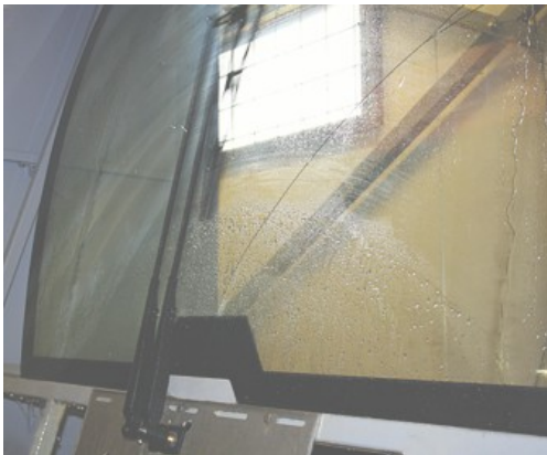
Exalto wiper test