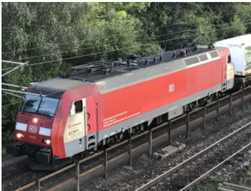
Locomotives, freight and passenger trains