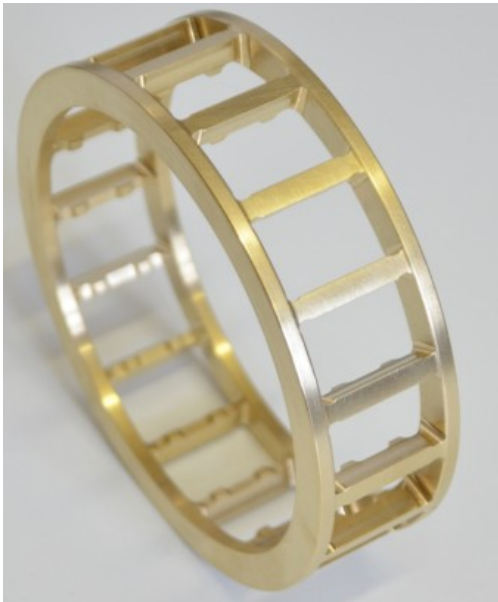
MPEA cage design for cylindrical roller bearings

Kugel- und Rollenlagerwerk Leipzig GmbH (KRW) presents the new MPEA cage design for cylindrical roller bearings at InnoTrans this year. The design was tested for its potential using a design-accompanying finite element analysis and a practical test at the TU Bergakademie Freiberg. All results clearly show the increased performance. Many European gear manufacturers already trust the MPEA design and equip their products with KRW cylindrical roller bearings.