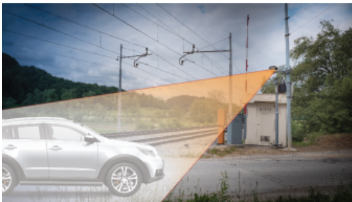
SALVIS LC - Level Crossing Obstacle Detection System