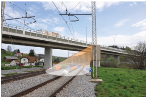
SALVIS X - Obstacle Detection System for monitoring railway tracks under road overpasses

The systems are designed to detect obstacles and monitor dangerous areas such as level crossings, station platforms, tunnels, bridges, viaducts, places under the road overpasses etc. They can detect dangerous situations such as cars or people who are stuck on the level crossing, passengers who have fallen from the station platform to the track, lost load and other objects that have fallen from overpasses, landslides, avalanches, mud, rocks, trees and other dangerous obstacles. The devices operate in all lighting conditions (day, night, direct sunlight) and in the most severe weather conditions. Obstacles can be detected reliably regardless of the type of material.