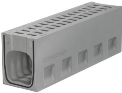
FILCOTEN one channel body with joint sealing profil