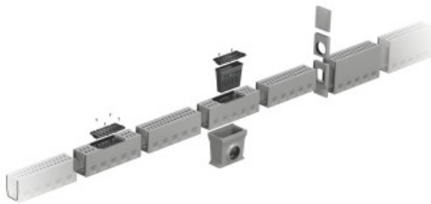
FILCOTEN one system depiction

The new FILCOTEN® one is a monolithic channel, which means channel and grating are cast in one piece. Through this, the channel can be used in highly dynamic loads, for example railway crossings, airports, industrial spaces, asphalt surfaces and many more. The construction with the tongue and groove system enables an installation in either direction. Furthermore, the surface profile with S-Design guarantees a safe and easy drive over. Therefore our specifically developed and innovative material is used: The FILCOTEN® HPC (High Performance Concrete). FILCOTEN® HPC combines excellent properties with sustainability. It convinces with 100% recyclability, certified absence of harmful substances as well as a verified LCA (life cycle assessment). FILCOTEN® HPC preserves humans and nature.