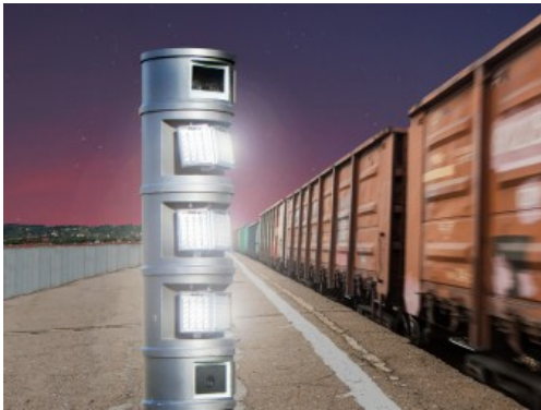
NUMBERCheck sensor pillar