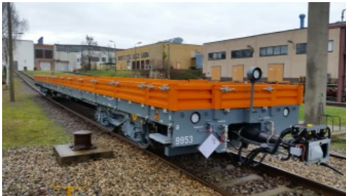
4-axle special flatbed railcar, 21 m

Maschinenbau und Service GmbH offers comprehensive development, production and service expertise for tomorrow's vehicles and production systems. The latest products from MSG mbH – Railcar Construction Ammendorf – are rail-borne work vehicles for maintaining the Munich Underground railway network. They have been developed and manufactured by MSG specifically for this purpose. Two of these flatbed cars will be presented for the first time on the rail yard at InnoTrans 2018. Stadtwerke München ordered three flatbed railcar variants: 14 m and 21 m (extra-long) 4-axle vehicles with a loading height of 1,100 mm above rail top edge, and 10 m long, 2-axle special flat cars with a loading height of 810 mm above rail top edge. The cars are equipped with: coupling point, control/command/signalling, front and rear lights, load-dependent graduated brake, bogies with disk brakes, shunter's stand usable on both sides, category C-II obstacle deflector and load indicator (overloading not possible).