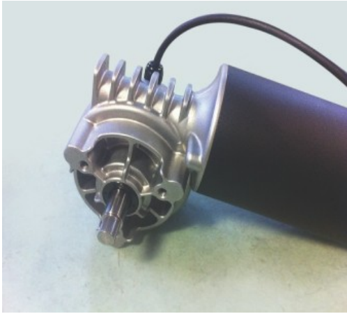
Hepworth's new Parvalux Motor

Hepworth Rail launch the new Parvalux Motor. Hepworth, the largest distributor of the motor, has been working closely to support Parvalux's continuous improvement and re-design of the new L3P MKII wiper motor. Areas of improvement include: increased standard IP rating; re-designed gear wheel teeth to increase load capacity; reduced backlash/operating noise level; cooling fins; gearbox collar shortened reducing bearing load; reduction in LCC due to significant brush life increase; new finishing process enhancing robustness/protection of the motor, plus many more additional improvements made, enhancing performance and aiding manufacturing processes. The motor meets all the existing specifications with little change to size and weight.