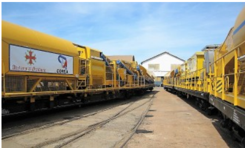
Yellow train: Concrete train for Crossrail, capacity about 250 m 3 /day