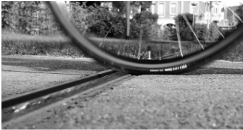
Velosafe track prevents accidents

Tram tracks are a problem for cyclists. In order to reduce the risk of accidents, Dätwyler has developed a velosafe track, which prevents wheel seizing in the rail groove. Pedestrians also benefit from it as it is less likely to twist an ankle. Dätwyler achieves this by screwing a safety profile into the rail groove. A track guiding plate restricts the sine curve of the track wheel and thereby increases the lifetime of the rubber profile. The entire construction can be removed at any time and without much work, for example to perform rail work. The groove has a draining channel in order to completely rinse it, so dust and dirt do not build up in the groove. With the newly developed RAILRESTORE, Dätwyler is presenting another innovation. With this, one can eliminate rail breaks in shortest possible time at highest level.