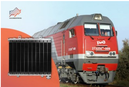
Mechanically bonded radiator

Cooling Systems Plant LLC, based in Belarus, specializes in design and manufacture of copper-brass radiators for cooling different types of coolant fluids (oil, water, antifreeze) used in high-power internal combustion engines (up to 5,000 kW). The Company is exhibiting at InnoTrans for the first time with its latest range of high performance cooling systems of diesel engine of railway machinery such as main-line and shunting locomotives. One of the Company's brand new products is mechanically bonded radiator. Bolt-on radiator does not have soldered joints and tube expander that provides a high degree of serviceability. The combination of technologies and high quality materials makes it possible to create an optimal radiator design for operation in heavy-duty conditions. The main advantages of cooling systems are exceptional reliability, high corrosion resistance, long service life and ease of maintenance.