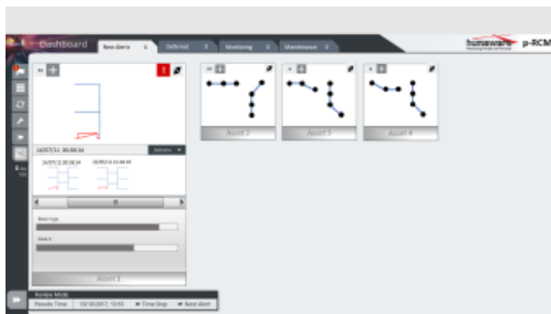
Innovative dashboard - 100% surveillance of asset health