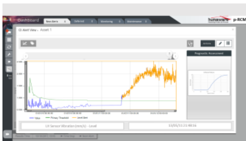
Prognostic information to reduce unplanned maintenance

p-RCM provides an improved, data driven approach to obtain RCM benefits; minimising service interruptions and the associated costs due to unplanned downtime. p-RCM utilises advanced data driven algorithms and anomaly detection techniques that do not require threshold setting to provide industry proven diagnostics and risk-based forecasting of remaining useful life, enabling the dynamic scheduling of maintenance across a range of assets. p-RCM ensures 100% surveillance of asset health 100% of the time, allowing rapid identification of potential asset health issues. The novel and easy-to-understand HMI provides actionable information that enables engineers and planners to assess information without the need for detailed analysis of the data.