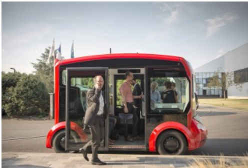
i-Cristal: 100% new generation autonomous shuttle

i-Cristal is a new autonomous public transport shuttle for the «last mile » mobility. This quiet and 100% electric vehicle has a zero CO2 and GHG emissions. It benefits from the industrial approach of Lohr in public transport and the experience of Transdev as a mobility services operator for a new means of transport. The capacity of the vehicle is for 16 passengers and the full charging time of the battery is 90 minutes (50% in 30 minutes). The vehicle operates in complex urban environments such as cross-roads or roundabouts and can avoid obstacles with a maximum speed of 50 km/h (70 km/h in the near future). The security module guarantees that the vehicle will stop if necessary. Its communication module assures a constant connection between the vehicle and Transdev Supervision.