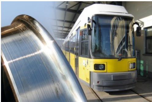
Fully automatic monitoring of wheel and track treads