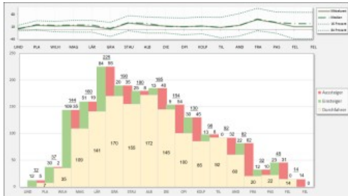
Occupancy level and passengers boarding/disembarking over the journey. Top: Punctuality curve