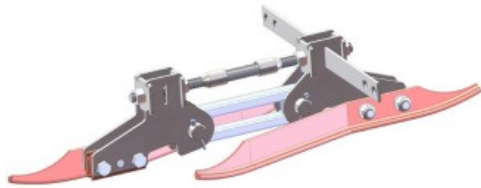
Section insulator Save-T (design modifications are reserved)

The globally operating company Arthur Flury AG manufactures high-quality electromechanical components and systems. At InnoTrans two new products for the tramway overhead contact line will be presented: The new Save-T section insulator is an innovative solution for 1 kV DC systems. It can be used at relatively high speeds in both directions, convinces by its low weight as well as the proven Arthur Flury quality and is quickly installed. Another new product innovation is based on a further development of the proven FDX tram crossing and is system-specifically adjustable between 50 ° - 90 ° for flexible use.