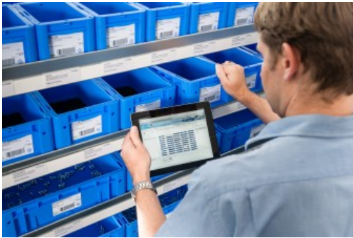
FALCON, the revolutionary kanban solution by Ferdinand Gross