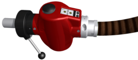
Roediger suction pistol type UP7