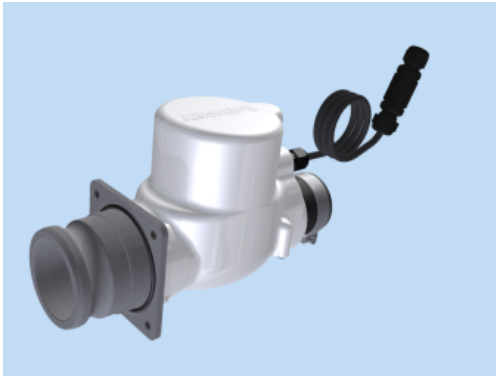
Automatic Roediger train valve type AV183-40

For almost 30 years now, Roediger wastewater disposal systems have been proving their efficiency in service depots of Deutsche Bahn and other railway companies. Now, for the first time Aqseptence Group presents the next generation train valves and extraction pistols for the automatic extraction of toilet wastewater from trains during InnoTrans trade fair. These, once again, have the top quality that Roediger is well-known for. The new valves are cost-efficient – with low weight and a compact design – and allow for drip-free and odourless wastewater extraction, with easy and intuitive handling. Such a drip-free and odourless Roediger disposal system also ensures that there is an optimum level of operator safety at the workplace, and automation of the extraction process prevents any potential mishandling. Roediger suction pistol type UP7