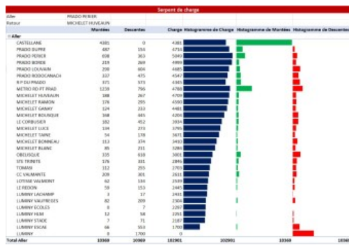
Load graph for the complete line over a selected period