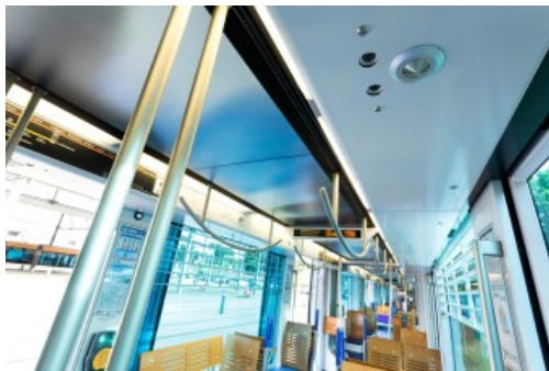
ACOREL solution integrated in Marseille transport network

The ACOREL automatic counting solution relies on sensors installed on the vehicle doors, which record the number of passengers getting on and off in real time. The data collected, enhanced by other systems (VMS, TMS, GPS, etc.) are then processed and analyzed by the software Focus on Board, which produces standardized or custom reports. This solution helps to: fight against fraud, manage and optimize the transport network and human resources, ensure a fair distribution of revenue, inform passenger in real time and deliver factual arguments for communications.