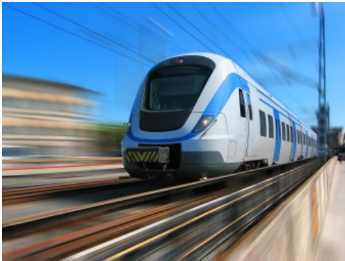
SuperFlex is suitable for many rail applications