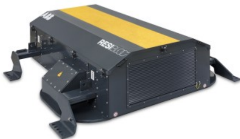
First cast resin main transformer RESIBLOC® Rail for rolling stock

ABB will be presenting three world premieres: The first cast-resin main transformer RESIBLOC® Rail for rolling stock based on a further development of the proven RESIBLOC® technology. It offers a significant reduction of energy and maintenance costs of the drive system of rail vehicles. Another world premiere is ABB's connected asset lifecycle management solution - ABB Ability™ Ellipse®, connecting assets in the field to the boardroom, providing high-resolution insight over transportation networks and operations for revolutionary efficiencies. Finally, ABB will present the new robust and highly-secure multiservice platform for mission-critical communications – XMC20, to pinpoint exact vehicle locations and to monitor the equipment keeping the network moving.