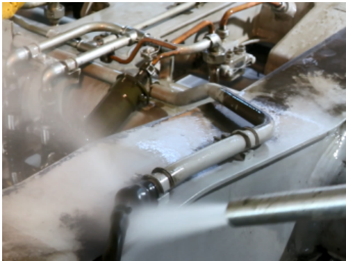
Cleaning of bogies using SpeedMaster

The JetMaster system from mycon GmbH has been used successfully for years to clean lamellar heat exchangers and other sensitive surfaces. Kipp Umwelttechnik GmbH, sister company of mycon, has now developed another process for cleaning even viscous grease layers: SpeedMaster. The process works just as gently as the JetMaster system. SpeedMaster can be used to clean bogies in the railway sector, the inside of tanks, but also to clean pipes, bars and profiles. The cleaning agent is completely recyclable. The release of the new process for all applications is scheduled for September 2018.