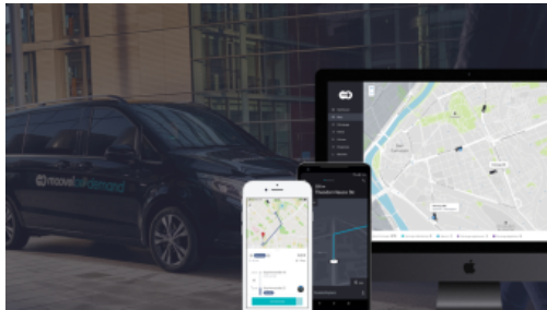
moovel on-demand product: Rider App, Driver App and Operator Dashboard

The moovel on-demand ridesharing platform helps transport providers to extend their networks dynamically through intelligent journey management ("routing") and the grouping of journey requests ("pooling") to flexibly adapt their services that meet customers' needs. Using advanced algorithms, moovel on-demand enables transport providers to manage and utilize their operations more efficiently. The solution can be incorporated seamlessly into existing local transport services, making it a valuable tool in the ongoing development and expansion of any transport network. moovel acts as a partner to cities, transit authorities, and end customers.