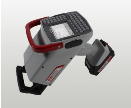
Hand-held marking system FlyMarker® mini