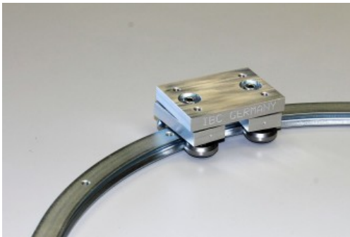
IBC FLEXY-Runner Curved Guide

IBC Wälzlager GmbH has adapted and extensively expanded its comprehensive wide range program of linear motion bearings and telescopic guides to the requirements of their customers for applications in the area of railway technology. The IBC product range has new systems for door openings, steps, battery extraction, electronic-cabinets and interior parts now available. For example carriages in user-specific designs that are used in door opening systems with several locking positions of telescopic pull-outs for electronic-units, that for service purposes, have to be extendable in various positions. IBC additionally offers separable telescopic pull-outs for applications with difficult to access housings, that fulfil all safety requirements. The outstanding features of the linear motion bearings and telescopic guides of IBC include their long service life, their user friendly-handling as well as their economic-efficiency.