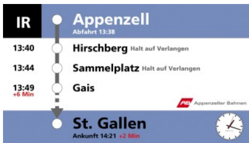
DiLoc|OnBoard – route map